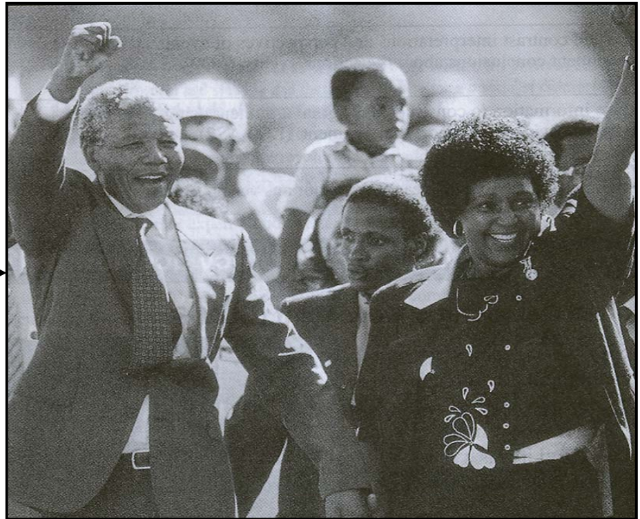
This is a photograph showing Mandela accompanied by his wife Winnie on the day of his release.

And so, on 11 February 1990, Nelson Mandela walked through the gates of Victor Verster prison, hand in hand with his wife, Winnie, towards a waiting crowd of supporters and the ranks of the world's media. It was a moment of liberation experienced around the world. Mandela was once asked how different was the man who emerged from prison after twenty-seven years from the one who went in. He replied, with characteristic brevity [a few words], 'I came out mature.' Mandela disliked talking about himself and allowed few glimpses of his personal thoughts or emotions.